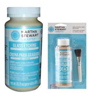
Martha Stewart Craft's Etching Cream <a href="http://amzn.to/1gIkwRs">http://amzn.to/1gIkwRs</a> <a href="http://amzn.to/1vuNrwt">http://amzn.to/1vuNrwt</a>